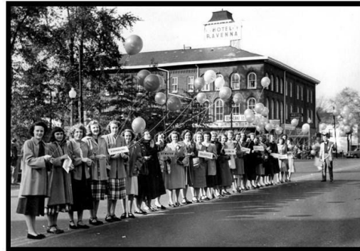
Parade on Main Street. Ravenna, Ohio, circa 1950.