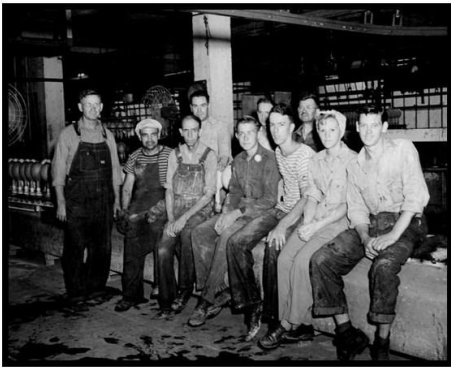
Oak Rubber employees making war supplies in Ravenna, Ohio, 1944.

Winner receives a $50 prize plus publication of his or her story. See submission form below.